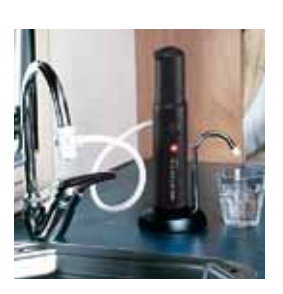
«Plus» add-on kit for connecting to taps at home, in a boat, in a caravan, etc.

For details on spare parts, please contact your Katadyn dealer.